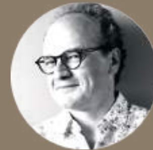
BERTRAND Branding & Advertising