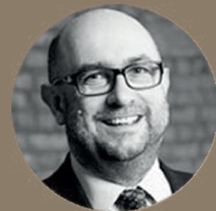
JOSEF Media & PR Germany