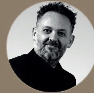
PIERRE Digital Strategy