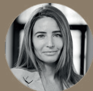
SUSANA Media & PR Spain