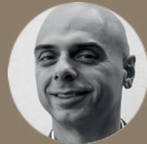
GIANGI Media & PR Italy