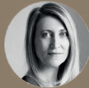
ALEXANDRA Dir Com